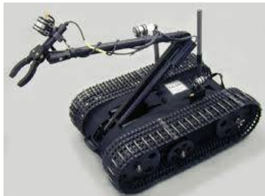
Figure 5: Mobile Robot

communication on Ethernet and develop a distributed I/O system using it as an onbody network for a humanoid robot HRP-3P. This paper is organized as follows. Section 2 explains why Ethernet is selected as an onbody network. Section 3 describes how to realize real-time communication on Ethernet. Section 4 presents a small-size controller to distribute all over the body. Section 5 explains a real time CORBA which works on realtime Ethernet. Section 6 measures the performance of a realtime communication library. Section 7 describes a distributed I/O system for HRP 3P using the real-time CORBA. Section 8 concludes the paper.