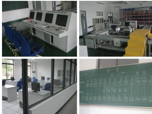
Figure 1: The first figure is the upper computers, the figure to left from back is the warehouse followed by the conveyors, third one is a view of the client computers and the fourth figure is the original sketch of the system map.